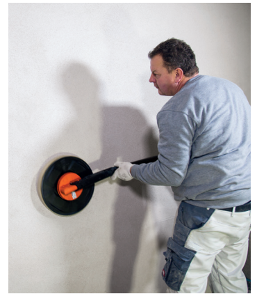
Adjustable rotation speed → for a perfect surface structure

· For abrading render and plaster after setting