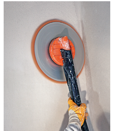
Smoothing up to the edges