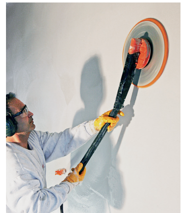
Relaxed machining due to low machine weight